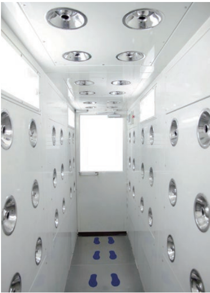
Air shower for workers

Design according to requirements of body size, operation method, various options, etc.